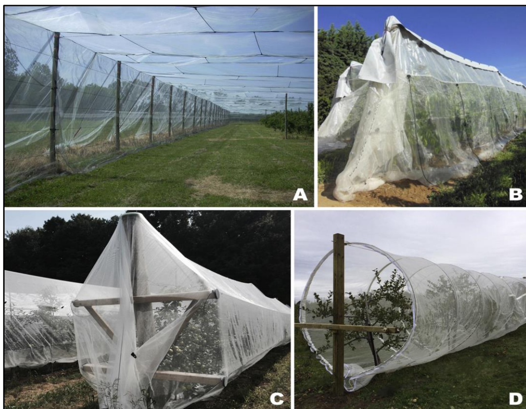
Fig.2. Incomplete (A, B) and complete (C, D) net exclusion systems (from Chouinard et al., 2016).