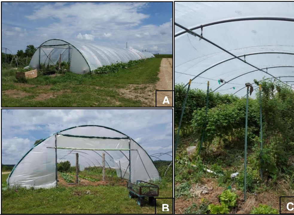
Fig.3. Plastic high tunnel (A, B) with raspberry plants (C) at Hoch Orchard & Gardens farm (La Crescent, MN)

Such exclusion barriers can protect crop plants not only by physical exclusion of insect pests but also by providing the microclimate which is unsuitable for developing pests (but favorable for plant growth and fruiting) (Table 1). Particularly, plastic cover in high tunnels can alter the solar radiation which may disrupt insect orientation and host location; this happens, for example, with Japanese beetle’s movement (Hanson et al., 2013) and behavior of thrips and whiteflies (Burrack et al., 2013). On the other hand, enclosing the plot may cause potential problems with temperature management for plants or development of secondary pests (Chouinard et al., 2016).